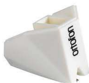
2M Mono / Verso