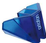
2M Blue / Verso