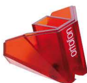
2M Red / Verso