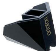
2M Black / Verso