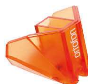
2M Bronze / Verso