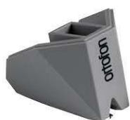
2M 78 / Verso

The 2M Bronze features a Nude Fine Line diamond stylus, which is particularly suited for demanding applications. The